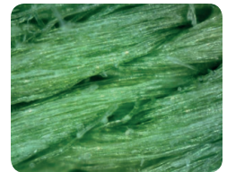
~500X - Cotton Tissue