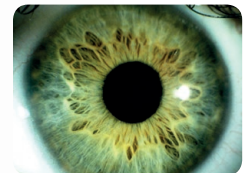
White Light Eye